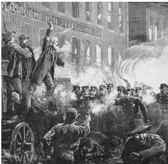
4. The idea of international terrorism erupted with the Haymarket bomb in Chicago on 4 May 1886, thrown at police breaking up a street meeting of anarchists – many of them recent German immigrants.

Freedom fighters must have some way of overthrowing tyranny, oppression, or imperialism. Is terrorism a viable way of doing this? Modern terrorism really took off with a technological revelation that seemed to make almost anything possible – the