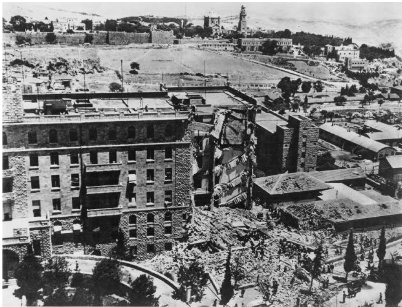
11. The destruction of the south wing of the King David Hotel in Jerusalem by the Irgun on 22 July 1946 killed 91 people, mostly civilian employees of the British government and military authorities in Palestine.