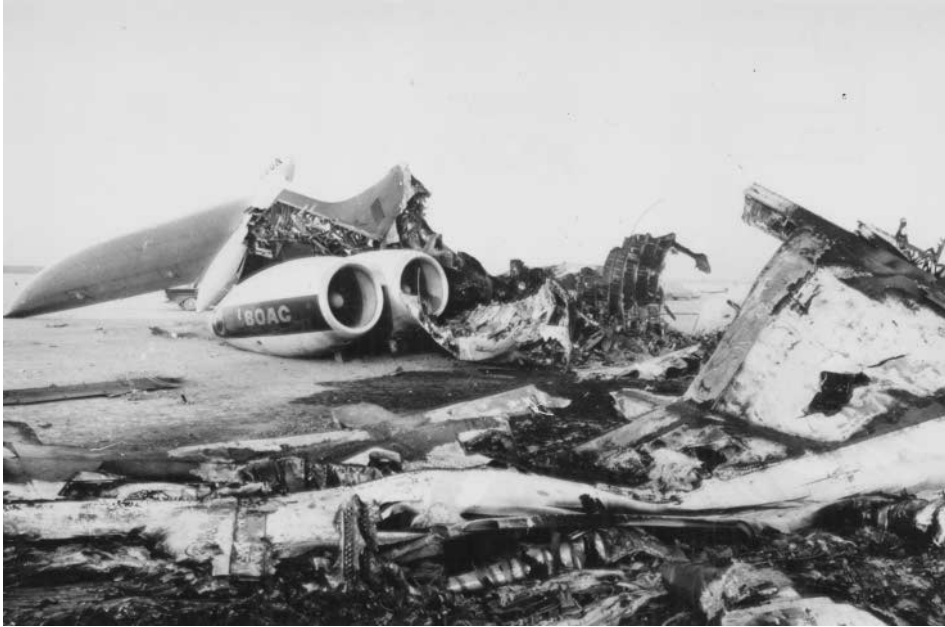
5. The emblematic drama of 'international' terrorism in the 1970s: a BOAC VC10, one of three airliners hijacked by the PFLP in September 1970, and destroyed on a Jordanian airfield.