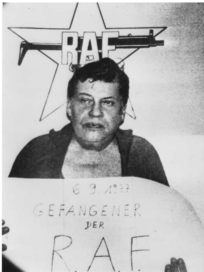
8. Hanns-Martin Schleyer, the industrialist (and former SS man) taken hostage by the Rote Armee Fraktion (RAF) in April 1977, a bid to secure the release of the group's leaders Andreas Baader and Gudrun Ensslin from prison – the placard reads 'prisoner of the RAF'.