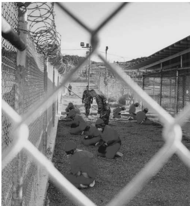
16. Al-Qaida fighters captured in Afghanistan, transported to Guantanamo Bay, Cuba, facing an uncertain future as suspected terrorists.

Whether in a perfectly controlled, rogue-state free world, terrorism would actually be eliminated may not have been the point in all this. There was at least room for suspicion that the threat of terrorism was being used as a pretext for striking down hostile regimes. The central problem that remained unaddressed was the survival potential of ideological/religious movements like al-Qaida, which combine a potent cause with a flexible, one-size-fits all organization. The ability of its members like Mohammed Atta, the hijacker of American Airlines flight 11, to operate for long periods in