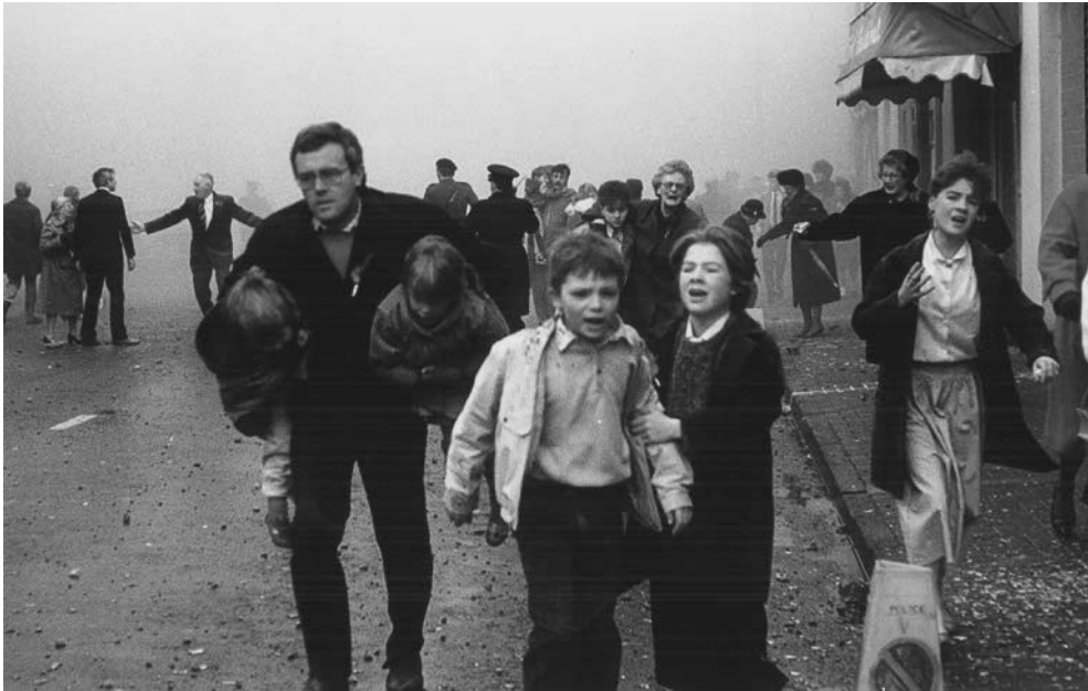
9. The bomb placed in Enniskillen by the IRA on 8 November 1987 was deliberately aimed at a key symbol of Unionist identity, a Remembrance Day parade: 11 were killed and 63 injured.