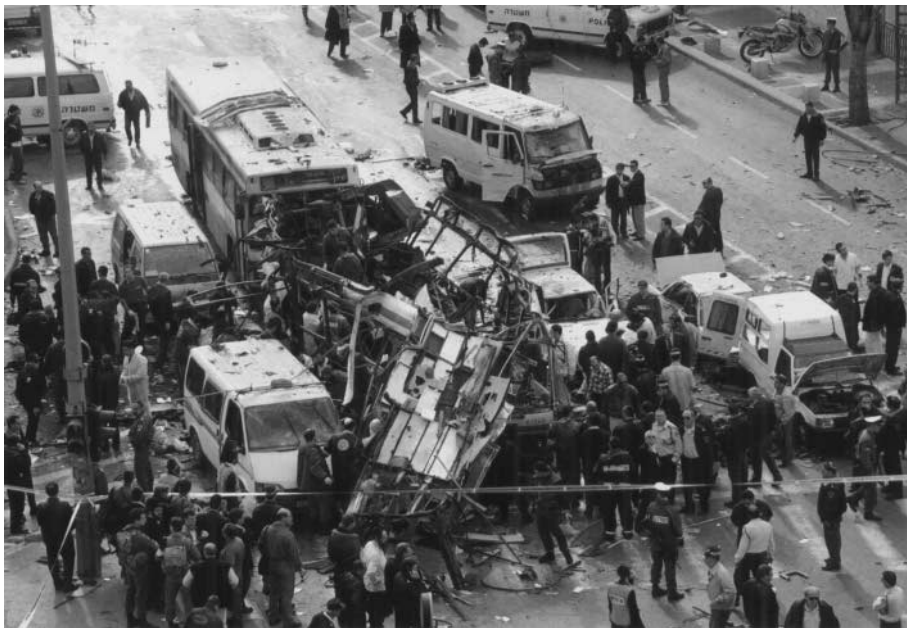
12. One of the most characteristic actions in the Palestinian conflict: 22 ordinary Israelis were killed when this bus was bombed by Hamas in Jerusalem in February 1996.