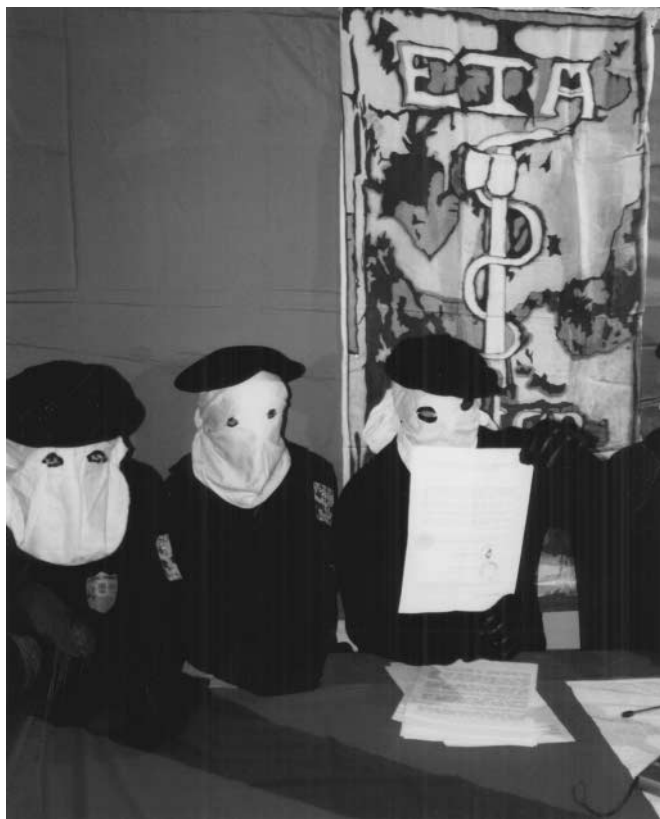
10. ETA representatives demonstrate the group's communication skills in announcing the end of their truce in November 1999.