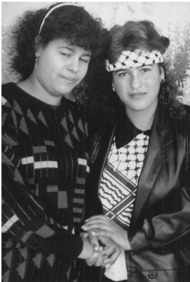
3. Waffa al-Edress, the first female Palestinian 'suicide bomber', or self-martyr, wearing the insignia of al-Fatah before her mission to a Jerusalem shopping centre.