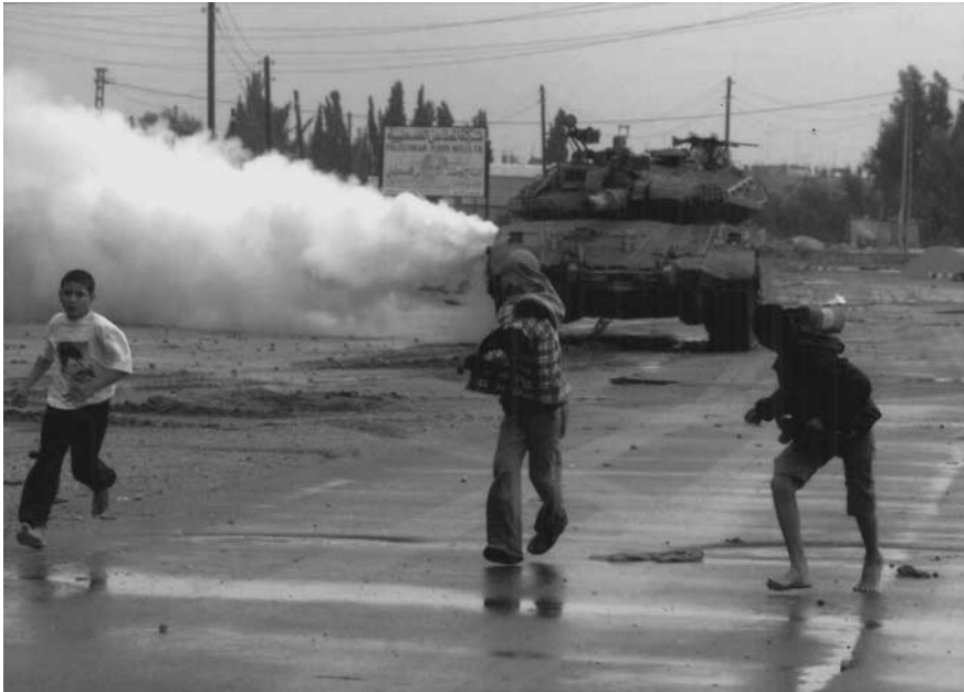
14. Attacking the 'infrastructure of terrorism' in Gaza: an Israeli military incursion at Beit Hanoun, 15 December 2001.