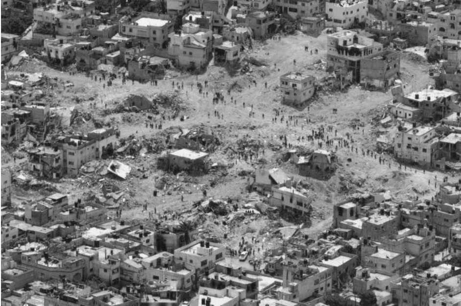
15. Israel's war against terrorism reached its height with the eight-day military assault on the Palestinian refugee camp at Jenin in April 2002; 10 per cent of the camp area was officially estimated to have been destroyed in the fighting.