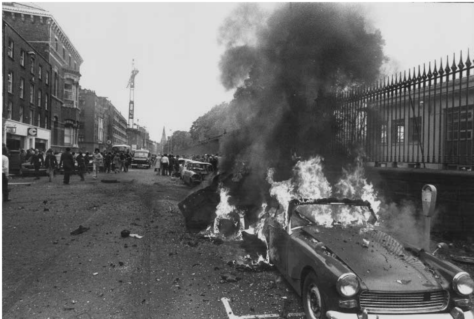
7. The explosion in South Leinster Street, Dublin, was one of three car bombs placed by Ulster Loyalist paramilitaries on 17 May 1974, killing 33 people altogether: a deadlier operation than any by the Irish Republican Army.